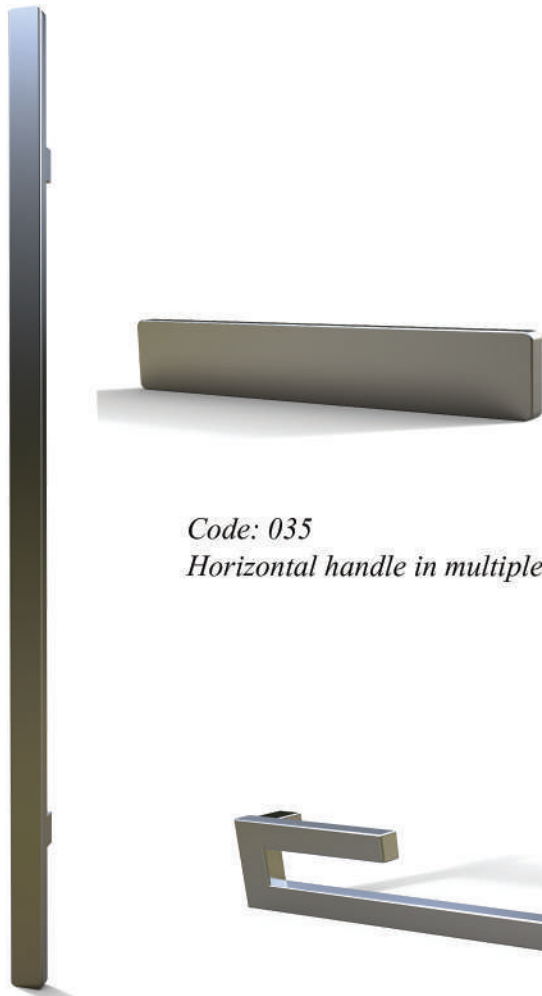
Code: 035 Horizontal handle in multiple sizes