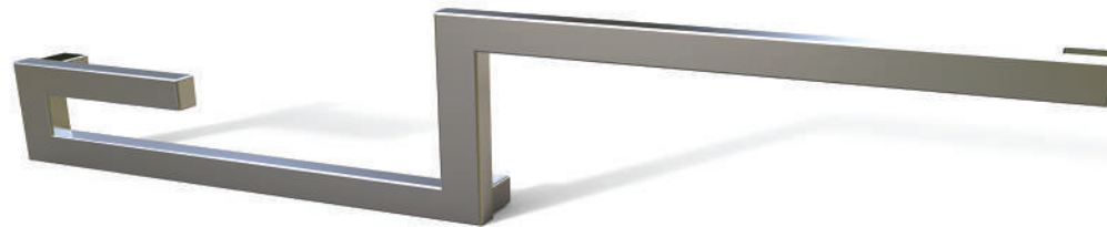
Code: 031 Horizontal asymmetric handle